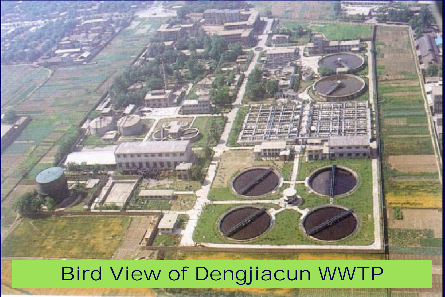
Bird View of Dengjiacun WWTP